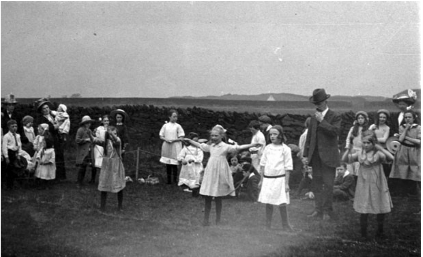
Skipping- Holy Trinity Day School, Gee Cross. Sports day c1920.