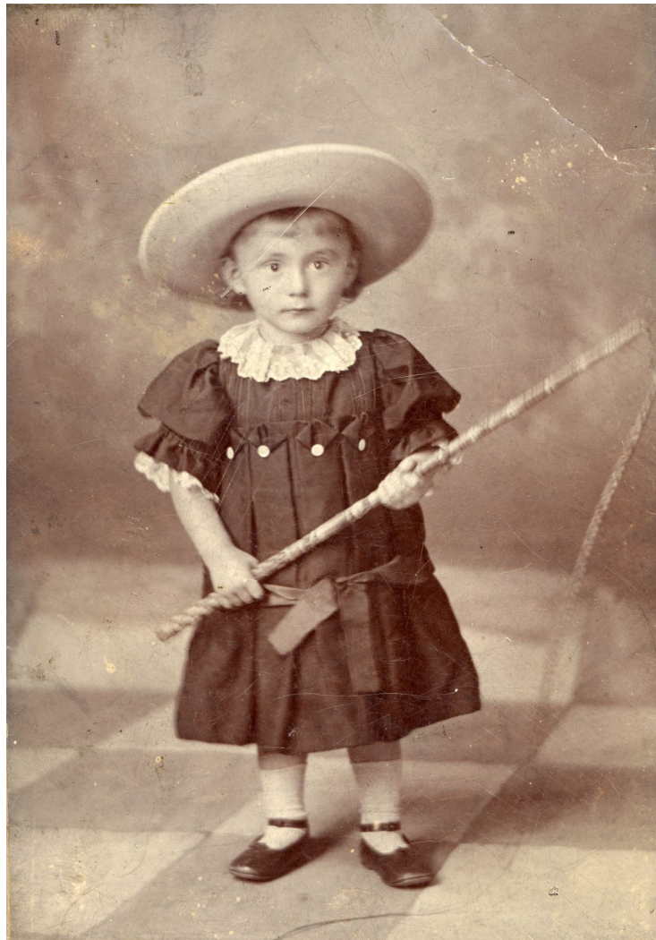
Unidentified young child from Hyde in studio holding a stick or whip. Circa 1910.

Selection of original photographs sourced from Tameside Local Studies and Archive Centre. To find out more please visit: www.tameside.gov.uk/localstudies