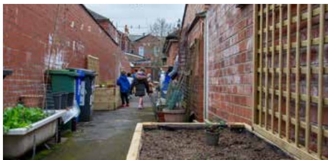
P7 Eco Streets project