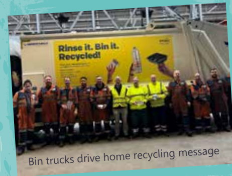
Bin trucks drive home recycling message

For more information see www.tameside.gov.uk/recycling