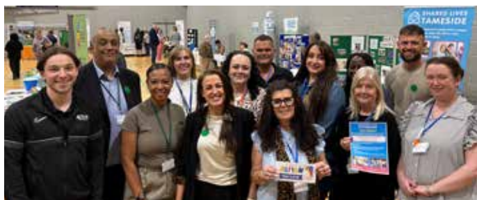
The team who organised and volunteered at the event enjoy the day's success.

Over 300 people visited the Proud To Be Me drop-in autism event at Oxford Park on 23 April to access information and advice from a range of organisations.