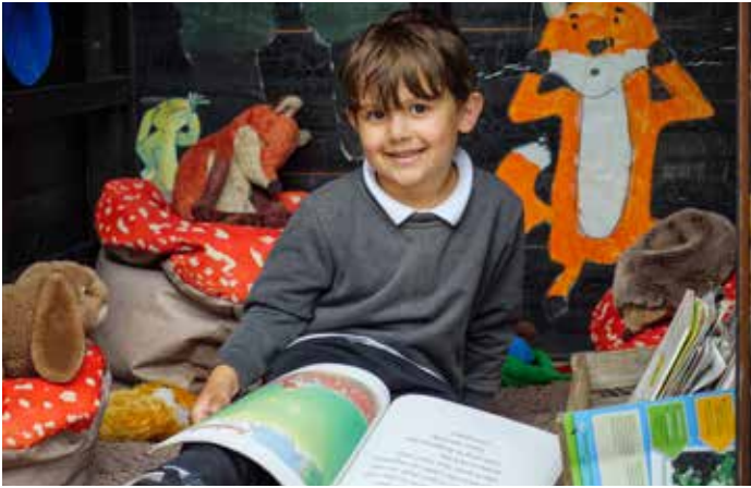
A child at St James Church of England Primary School, in Ashton, enjoying one of the many activities they have in the SEND Units.