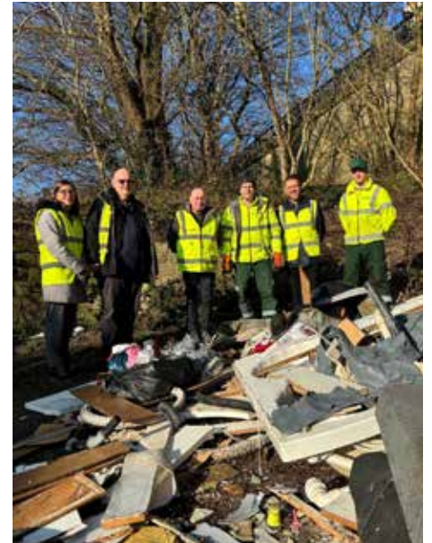
Enforcement and street cleaning officers tackling dumped waste

For further information on reporting flytipping and useful information to provide to help investigations see www.tameside.gov.uk/flytipping