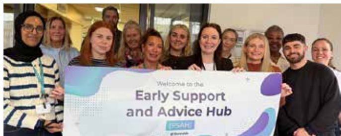
The team behind the Early Support and Advice Hub.

RESIDENTS needing support from adult social care can contact Tameside's Early Support and Advice Hub (ESAH) as their first port of call.