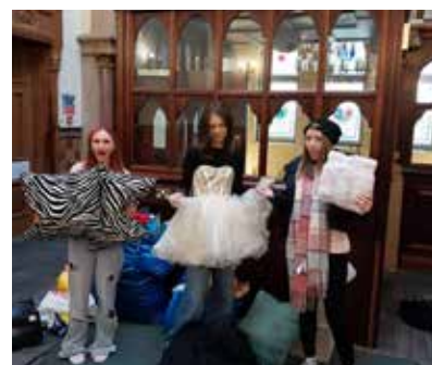
Young people look through donations at Cat's Wardrobe.

Donations can be dropped off at the People Place (Ashton Library, OL6 6BH) every first Tuesday of the month from 2pm to 4pm.