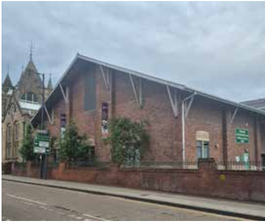
Tameside's Local Studies and Archive Centre

Tameside's Local Studies and Archive Centre has once again been recognised for its high standards, retaining its accredited status for the seventh consecutive year.