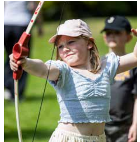
A young girl has fun with a bow and arrow during Stamford Park's Spring Family Fun Day.

Community stalls from local organisations and council services were on site to offer local support and advice.