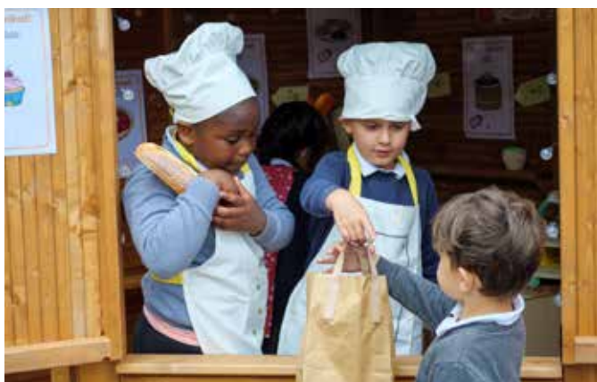
P15 SEND School Places to Increase