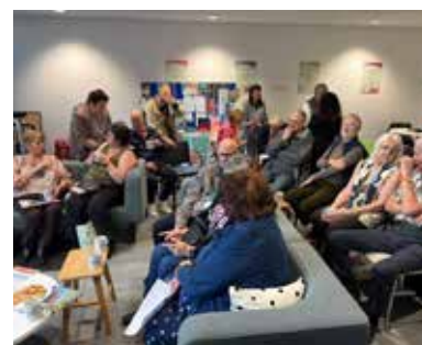
Carers enjoying the coffee morning.

The Carers Centre continues to help people feel valued, informed and connected. Open to all carers, everyone is welcome. Visit www.tameside.gov.uk/carers or call 0161 342 3344. Carers can also connect on Facebook for regular updates, search 'Tameside Carers Centre.'