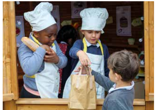
Children enjoying a range of tailored activities in the SEND school places.

The funding received from the Department for Education (DfE) will provide high-quality, inclusive provision within well-established schools with proven expertise in meeting SEND needs.