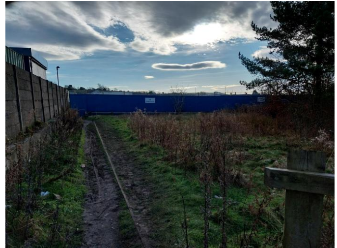
Site as viewed from A57 (Nov 2024)

Views: Development proposals should consider how the site is framed from viewpoints on John Kennedy Road, John Kennedy Garden and the A57.