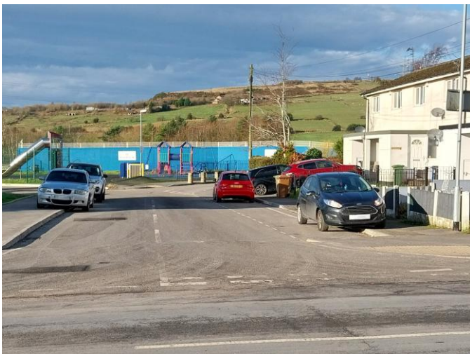
Site access from John Kennedy Road via Manley Grove (Nov 2024)

Privacy distances: Any development of two storeys or more must be a minimum of 21 metres from the existing housing on John Kennedy Garden and Manley Way, dependent on the location of habitable rooms, in accordance with RD5 of the Tameside Residential Design SPD.