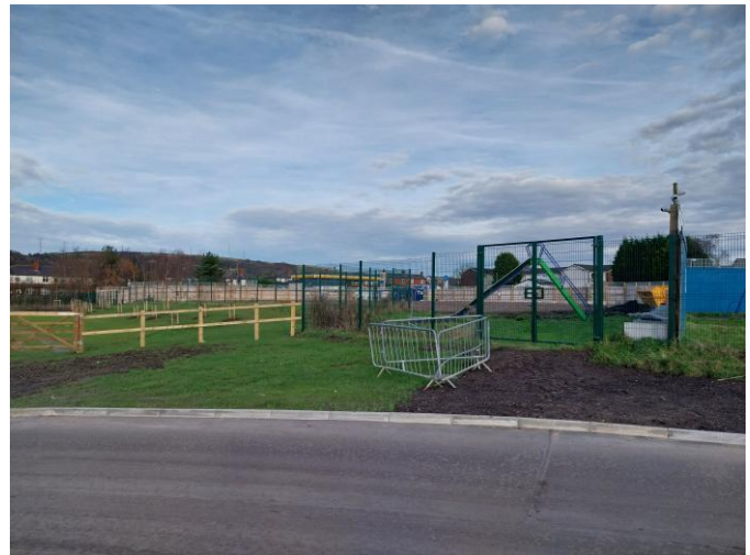
Site as viewed from Hawthorns School (Nov 2024)

Topography: The site is largely flat with a minor fall in gradient from north to south. Neighbouring properties to the east sit at a slightly higher ground level; the Hawthorns School playing field to the west sits at a significantly lower ground level.