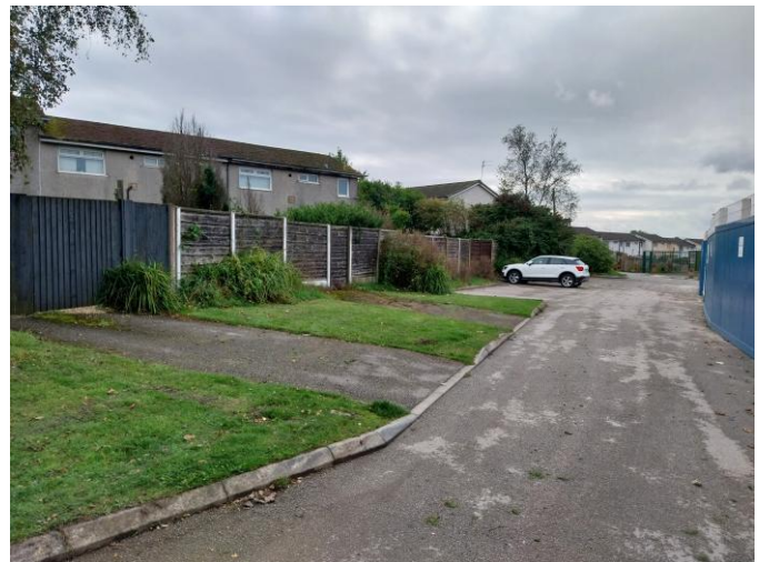
Area to be retained for access rights (Sep 2024)

Primary vehicular and pedestrian access to the site is from Manley Grove. Pedestrian access from the A57 Hyde Road and John Kennedy Garden should be retained. There are long-user rights of access into the rear gardens of properties on Manley Grove as indicated on the proposals map that will need to be retained. There should be adequate access for refuse collection and adequate space for storage of waste and recycling bins.