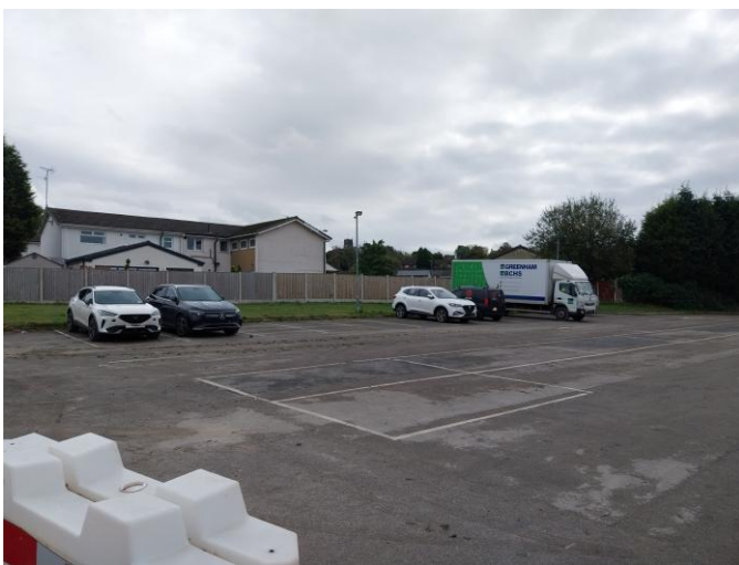
View from inside the site looking east (Sep 2024)

Proposals should take account of the Fields in Trust ‘Guidance for Outdoor Sport and Play’ to include an appropriate buffer zone to the community play area to the south, for the protection of residential amenity.