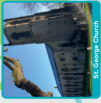
St. George Church

Refreshments and toilets are available before and after led walks