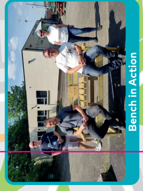
Bench in Action