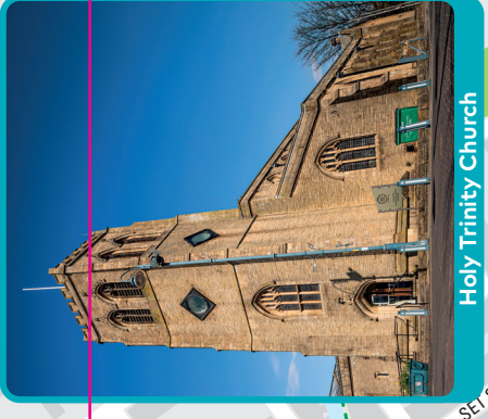
Holy Trinity Church