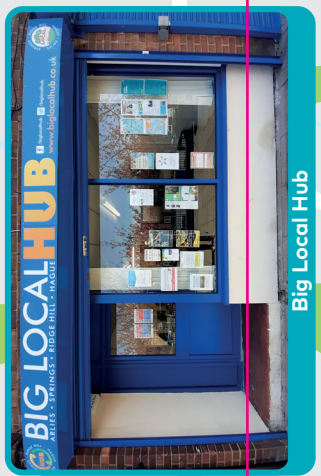
Big Local Hub

Boating Lake Figure of 8 approx 1 mile - 20 minutes