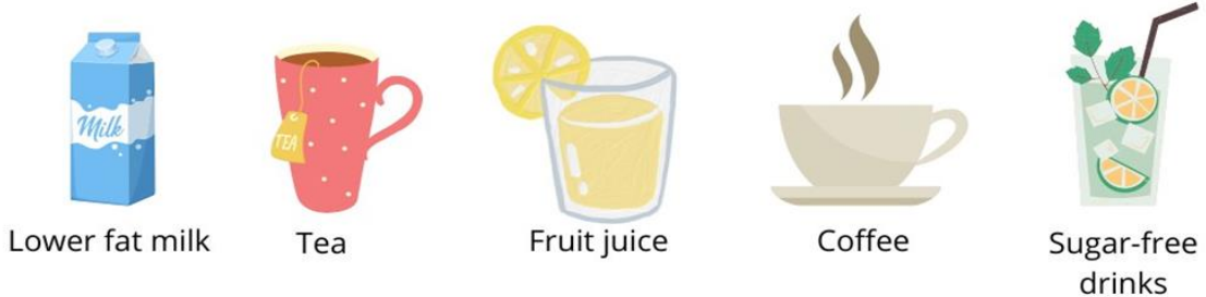
Lower fat milk